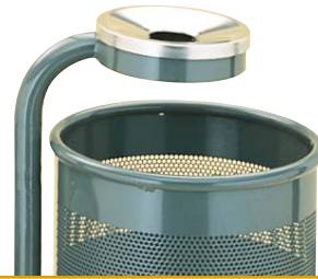
615 pag. 21