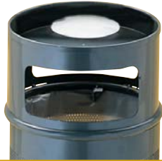
855 pag. 20