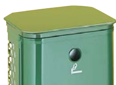
124 +168 pag. 23