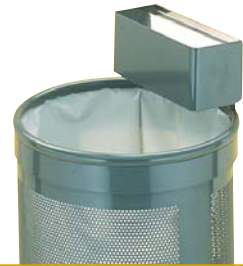
780-AC pag. 20