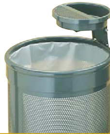
682-A pag. 20