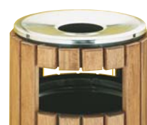
424 pag. 24