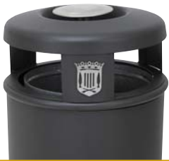
689 + 716 681 + 716 pag. 17