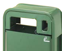
500 pag. 26