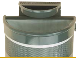
352-AC pag. 22