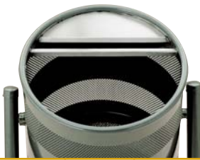
060-070 pag. 21