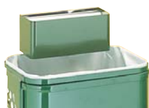
124-C pag. 23